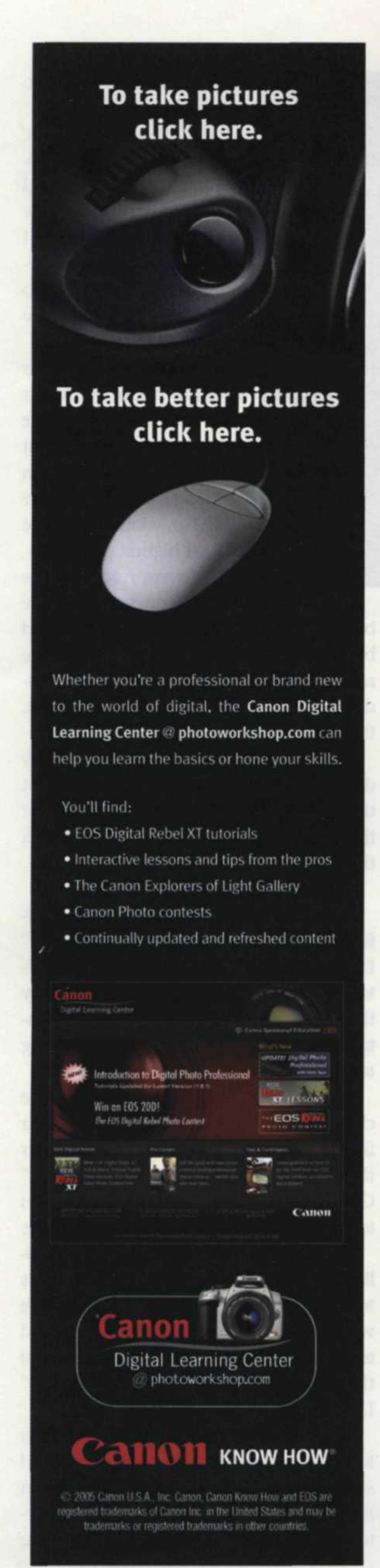
To request more information see pages 120 and 121